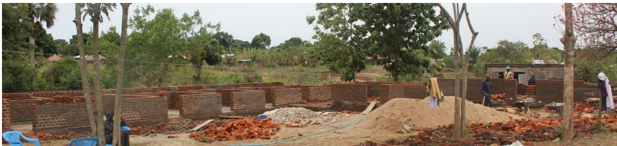
Rooms at RECONCILE at the end of the 1st Quarter.

the Nuba Mountains. (Further details on the recipients receiving scholarships through project funding will be included in next quarter's report).