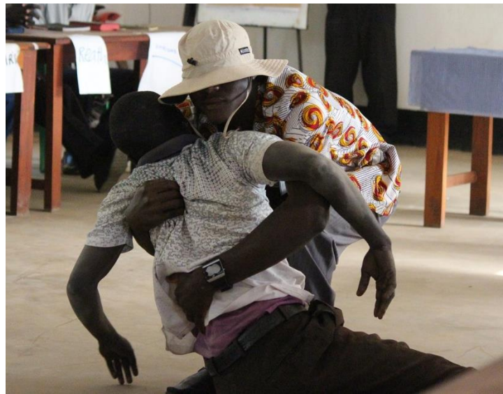
Above: RPI students' drama of the Good Samaritan Story in morning devotions