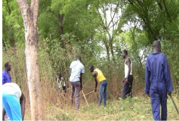
Above: Clearing the site for the new school in Pochalla.