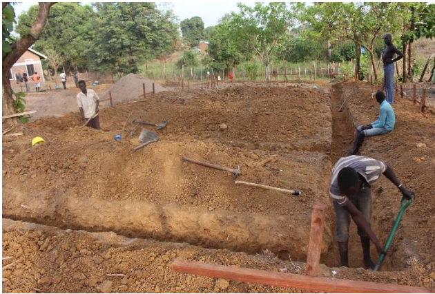
Above: Preparing the foundation of the women's dorm at RPI.